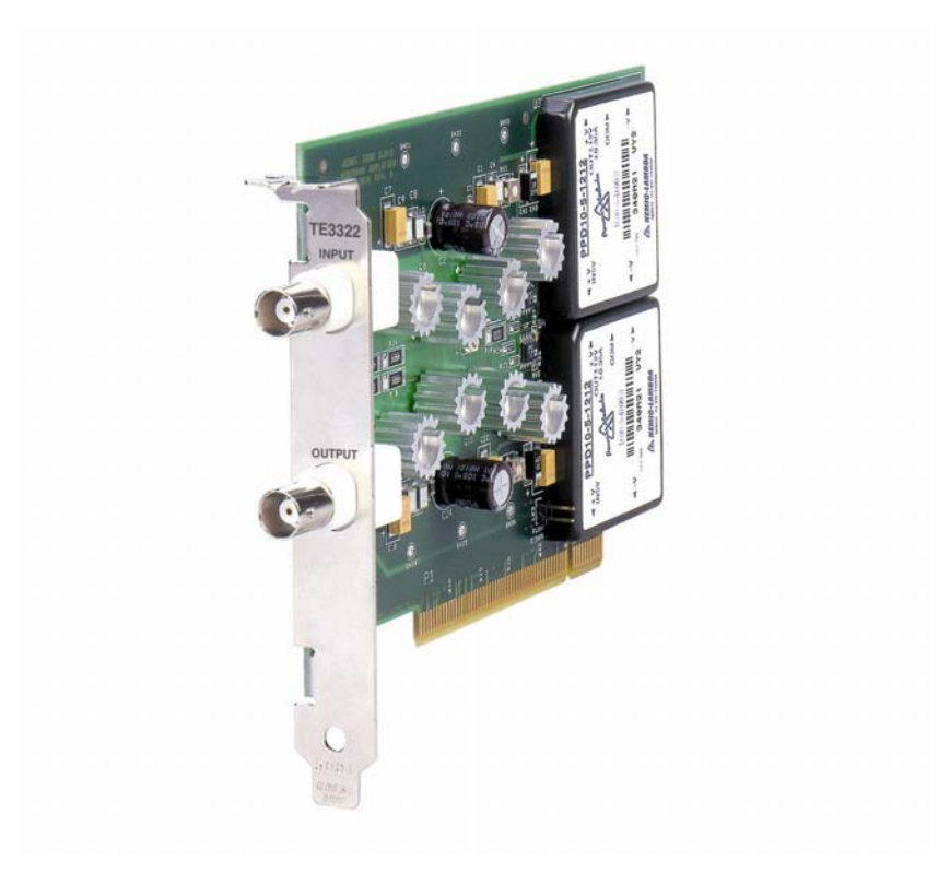
Figure 1-1, TE3322